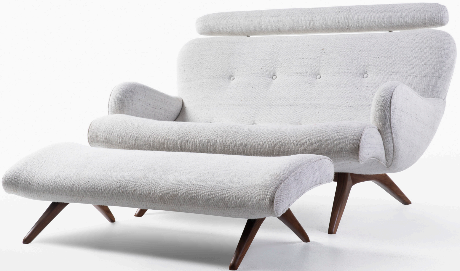
Loveseat and Footrest Model - 172S | Designed 1950